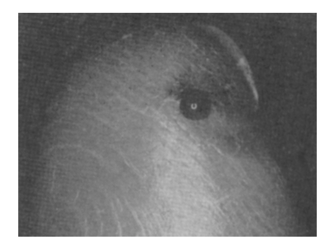
Figure 2. Injury to finger from crown of thorns starfish spine showing bleeding entry wound on pulp.

Reports also indicate that the wound turns a purplish blue colour soon after an injury has been sustained. Often this grows larger and is surrounded by an area of tissue which is light red in colour.<sup>18</sup> This region of erythema may persist for several days if not weeks. This may cause some victims to think that a portion of spine has remained in the wound. In addition to erythema, some victims may suffer from extensive oedema. Multiple punctures to a hand or foot may result in oedema occurring over the entire surface. This condition may last for up to a week during which time the wounds may leak serous fluid, numbness of the extremities may be felt<sup>16</sup> and swelling of the lymphatic glands may occur.<sup>8</sup> In such cases, victims