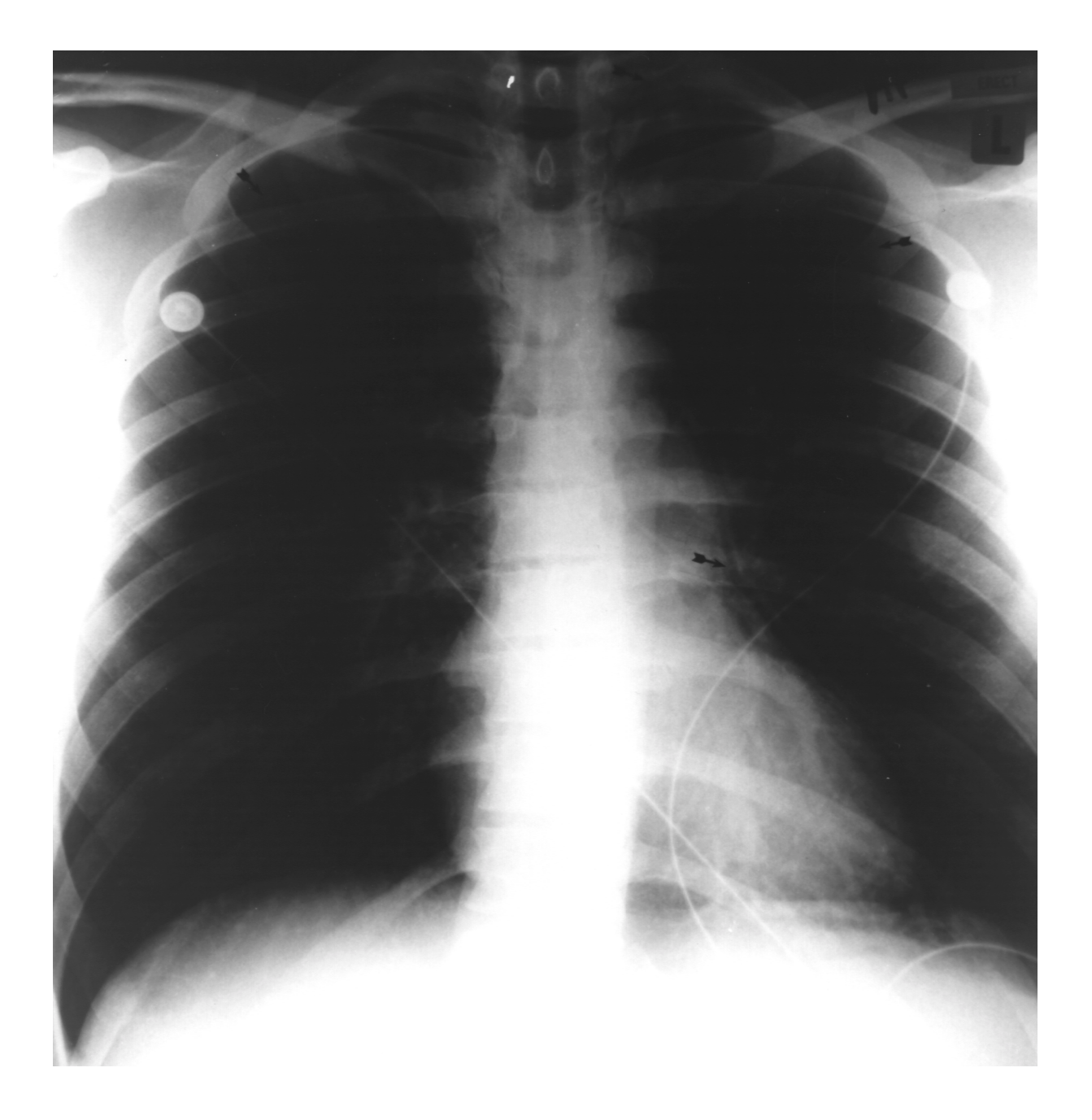
Figure 1. A-P chest X-ray demonstrating bilateral pneumothoraces, (black arrows at the level of left and right second ribs), left mediastinal emphysema (black arrow) and subcutaneous emphysema in the neck (white arrow).

60 minutes with a 30 minute ascent) in the next three days. He was discharged with bilateral 6/5 vision.