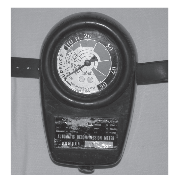
The SOS decompression meter