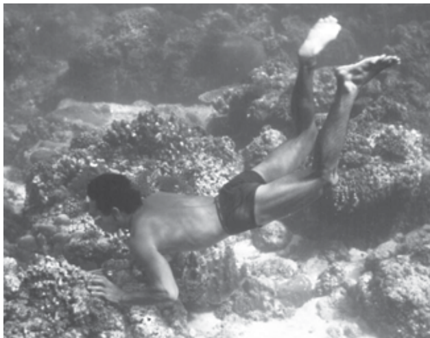
Figure 1 Bajau diver, Indonesia (left), Ama diver, Japan (right)