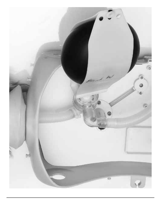
Figure 1 Test lung connected to manikin

operate. The laryngeal tube is a supraglottic airway device, some models having a distal cuff in the oesophagus in order to reduce the regurgitation of gastric content.