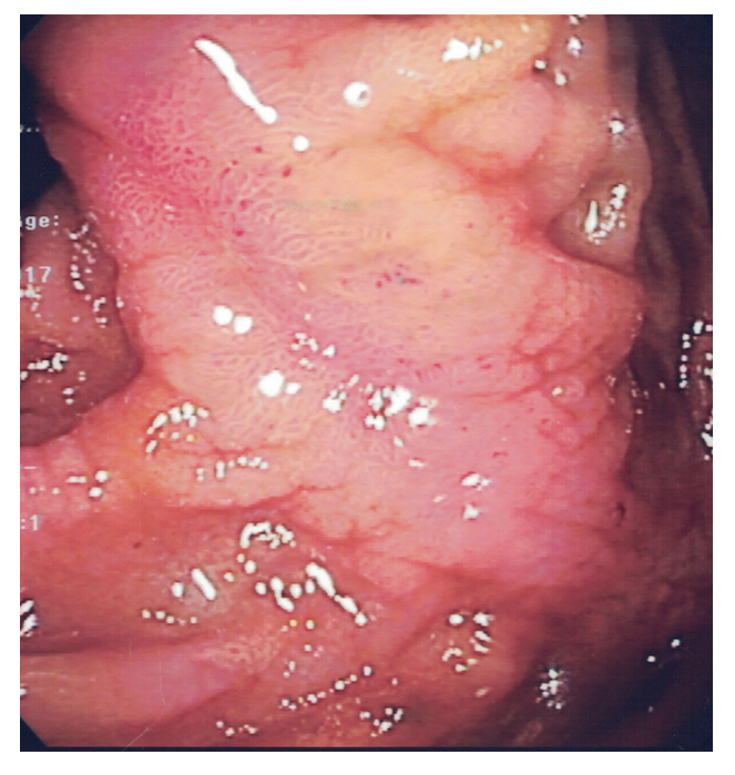
Figure 3 Healed ulcer, post 30 HBOT 90-minute sessions at 243 kPa, showing a healthy anastomosis with good vascular markings